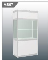
AS07 高身玻璃柜 Tall Glass Showcase 1000L x 500W x 2000H mm