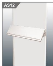
AS12 斜层板 Sloped Shelf 1000L x 300W mm