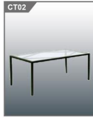
双人咖啡台 Coffee Table 1000L x 550W x 450H mm