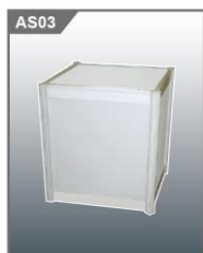
AS03 矮身展示台 Low Display Cube 500L x 500W x 500H mm