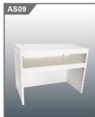
AS09 1M高咨询桌 Information Counter 1mH 1000L x 500W x 1000H mm