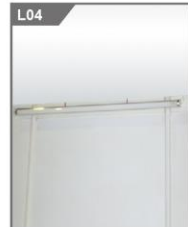
L04 21W LED日光灯 21W LED Fluorescent Tube