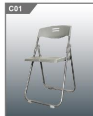
C01 折椅 Folding Chair 460L x 400D x 455H mm