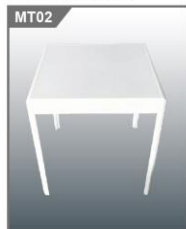
MT02 方台 Square Table 650L x 650W x 700H mm