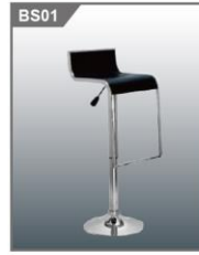
吧椅 Bar Stool 460W x 400D x 455H mm