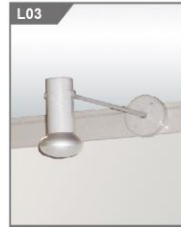
15W LED长臂射灯 15W LED Long Arm spotlight