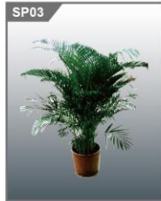
植物 Plant 1000H mm