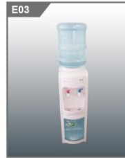
饮水机 Water Dispenser