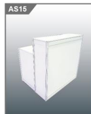
AS15 阶梯型咨询桌 Information Counter 1030L x 535W x 1100H mm