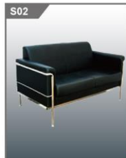
S02 双人沙发 2-seat Sofa 1500W x 700D x 450H mm