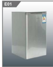
冰箱 Refrigerator(90L) 500L x 500W x 860H mm