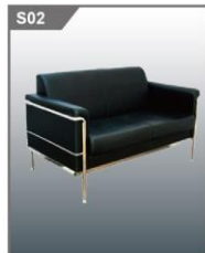
S02 双人沙发 2-seat Sofa 1500W x 700D x 450H mm