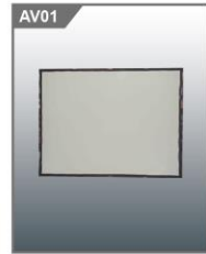
AV01 投影设备 Projector&Screen