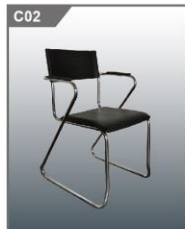
C02 皮椅 Black Leather Arm Chair 570W x 440D x 455H mm