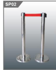
围栏 Barricade For Queue 1200H mm