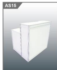
AS15 阶梯型咨询桌 Information Counter 1030L x 535W x 1100H mm