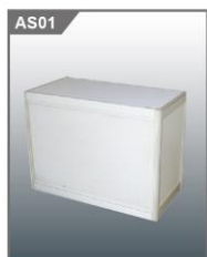
AS01 咨询桌 Information Counter 1000L x 500W x 750H mm