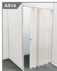
AS14 折门 Folding Door 950W x 2000H mm