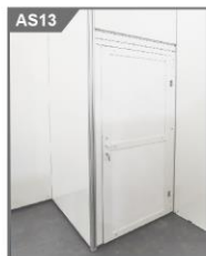
AS13 锁门 Lockable Door 950W x 2000H mm