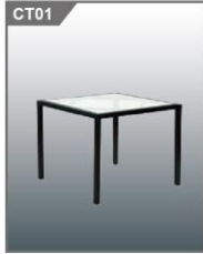
CT01 单人咖啡台 Coffee Table 550L x 550W x 450H mm