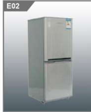
E02 双门冰箱 Refrigerator (140L) 500W x 500mm x 1350H mm