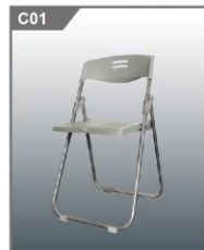
C01 折椅 Folding Chair 460L x 400D x 455H mm