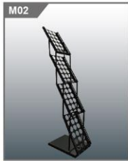
M02 杂志架B Magazine Rack B 270 x 250 x 1200H mm