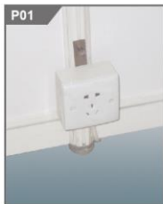
P01 插座 Power Socket (Square Pin) Max.500W