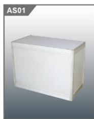
AS01 咨询桌 Information Counter 1000L x 500W x 750H mm