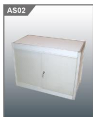
AS02 锁柜 Lockable Cupboard 1000L x 500W x 750H mm