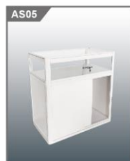
AS05 矮身玻璃柜 Low Glass Showcase 1000L x 500W x 1000H mm