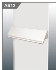
AS12 斜层板 Sloped Shelf 1000L x 300W mm