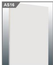
AS16 展板 Panel 1000W x 2500H mm