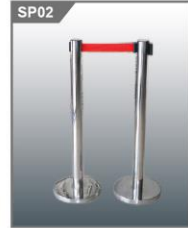
SP02 围栏 Barricade For Queue 1200H mm