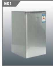
E01 冰箱 Refrigerator (90L) 500L x 500W x 860H mm