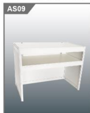
AS09 1M高咨询桌 Information Counter 1mH 1000L x 500W x 1000H mm