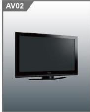
AV02 LCD LCD(42"50")