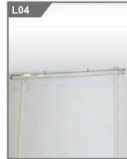
21W LED日光灯 21W LED Fluorescent Tube