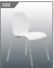
C03 葫芦椅 Glisso 480W x 550mm x 800H mm