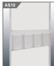
AS10 资料架 Catalogue Holder (metal) 950L x 50D x 280H mm