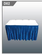
签到桌(蓝色围裙) Registration Table(blue cover) 1200L x 450W x 750H mm