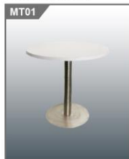
MT01 白色圆桌 Round Table 800Φ x 750H mm