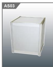
AS03 矮身展示台 Low Display Cube 500L x 500W x 500H mm