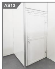
AS13 锁门 Lockable Door 950W x 2000H mm