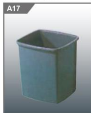
A17 废物箱 Wastepaper Basket 250L x 170W x 290H mm