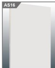
AS16 展板 Panel 1000W x 2500H mm