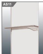
AS11 平层板 Flat Shelf 1000L x 300W mm