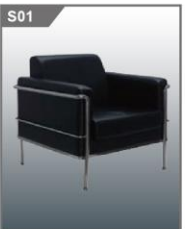
S01 单人沙发 Single Sofa 700W x 700D x 455H mm