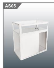
AS05 矮身玻璃柜 Low Glass Showcase 1000L x 500W x 1000H mm