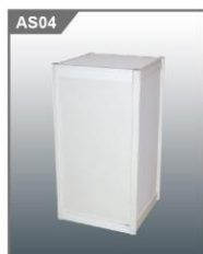
AS04 高身展示台 Tall Display Cube 500L x 500W x 1000H mm