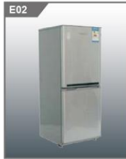
双门冰箱 Refrigerator(140L) 500W x 500mm x 1350H mm