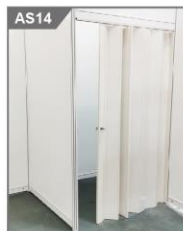
AS14 折门 Folding Door 950W x 2000H mm