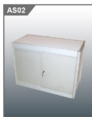
AS02 锁柜 Lockable Cupboard 1000L x 500W x 750H mm