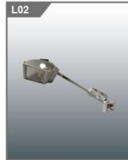
50W LED鸭嘴大灯 50W LED Spade lamp