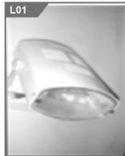
L01 75W LED大白灯 75W LED floodlight