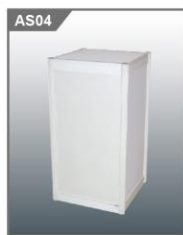
AS04 高身展示台 Tall Display Cube 500L x 500W x 1000H mm