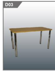
会议桌 Meeting Table 1400L x 700W x 750H mm