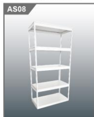
AS08 货架 Cargo Rack 1000L x 500W x 2000H mm