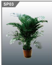
SP03 植物 Plant 1000H mm