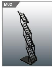
杂志架B Magazine Rack B 270 x 250 x 1200H mm