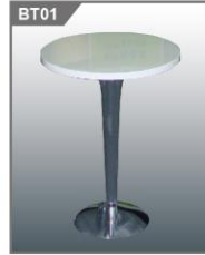
BT01 吧桌 Bar Table 600Φ x 1000H mm