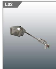
L02 50W LED鸭嘴大白灯 50W LED Spade lamp