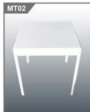
MT02 方台 Square Table 650L x 650W x 700H mm