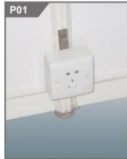
插座 Power Socket(Square Pin) Max.500W