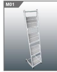
杂志架A Magazine Rack A 380 x 1500H mm