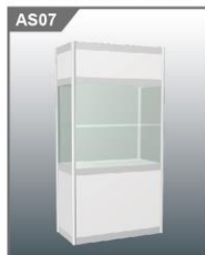
AS07 高身玻璃柜 Tall Glass Showcase 1000L x 500W x 2000H mm