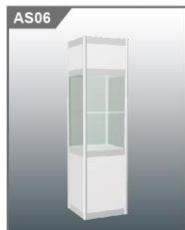
AS06 高身玻璃柜 Tall Glass Showcase 500L x 500W x 2000H mm