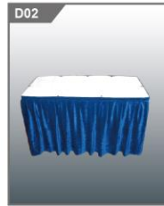
D02 签到桌(蓝色围裙) Registration Table(blue cover) 1200L x 450W x 750H mm