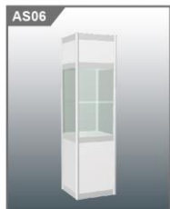
AS06 高身玻璃柜 Tall Glass Showcase 500L x 500W x 2000H mm