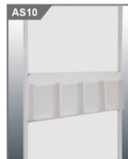
AS10 资料架 Catalogue Holder (metal) 950L x 50D x 280H mm