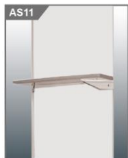
AS11 平层板 Flat Shelf 1000L x 300W mm