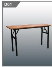
长条桌(无桌布) Long table w/o apron 1200L x 450W x 750H mm