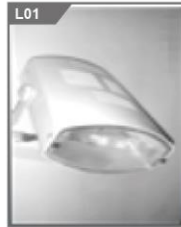
75W LED大灯 75W LED floodlight